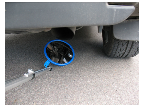
▶ Bomb Inspection