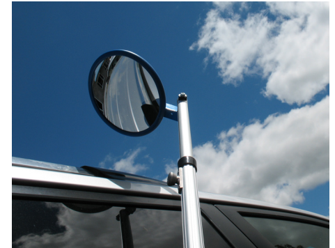
▶ Vehicle Inspection