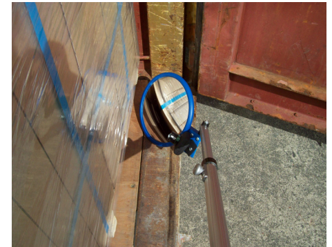
▶ Container Inspection