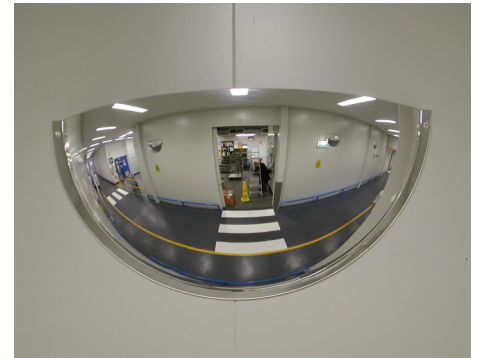
▶ Hospital Bay