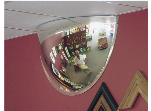
▶ Store Observation