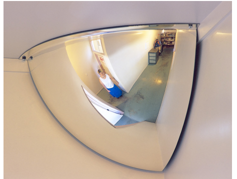
▶ Factory Corridors