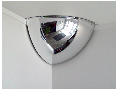
▶ Reception Entrance