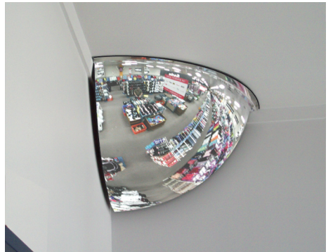
▶ Retail Observation