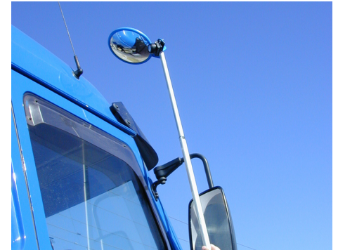
▶ Vehicle Inspection