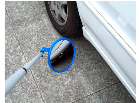
▶ Bomb Inspection