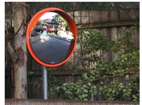
▶ Driveways and Parking Lots