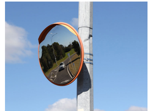
▶ Vandal Prone Areas