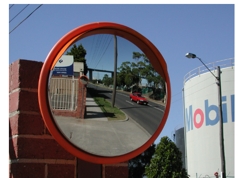
▶ Road and Traffic Safety