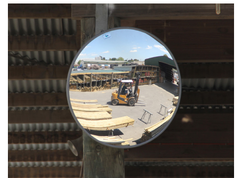
▶ Industrial Safety