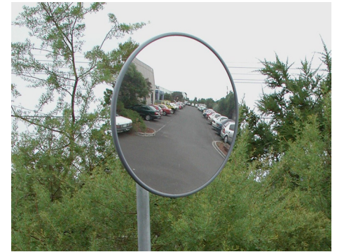
▶ Parking Lots