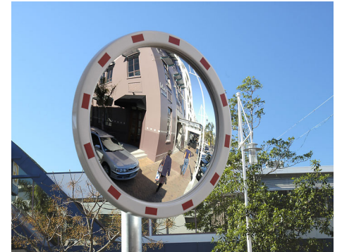
▶ Pedestrians and Sidewalks