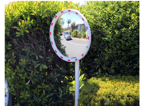
▶ High Visibility Traffic Safety