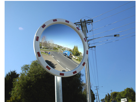
▶ Driveways on Blind Corners