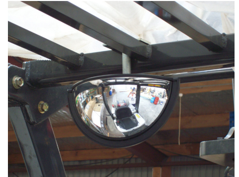
▶ Wide Angle Reflection