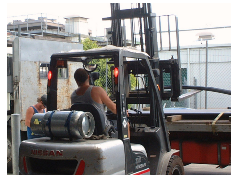
▶ Impact Resistant Mirror Face