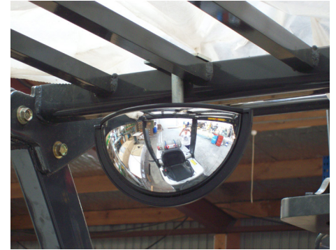
▶ Wide Angle Reflection