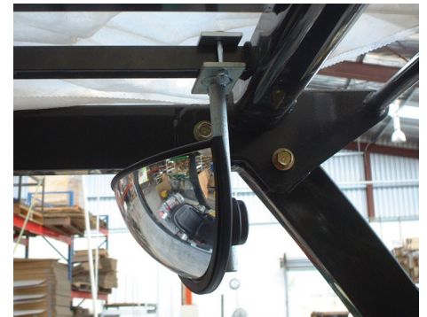
▶ 180° Viewing Area