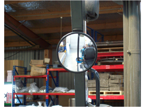
▶ Clear Undistorted Reflection