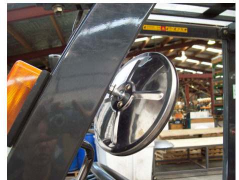
▶ Easy Installation