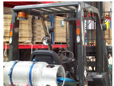
▶ Fully Adjustable