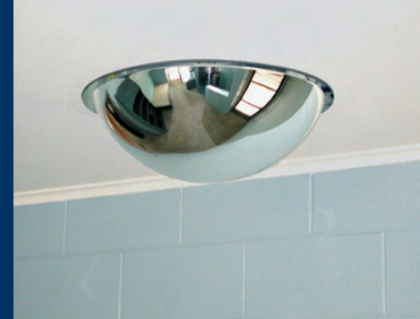
▶ Hospitals and Institutions

For Wide Angle Views in Tough Environments, Try The Stainless Steel Dome Mirror Range From DuraVision TM