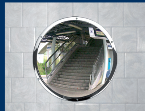
▶ Subways and Stations