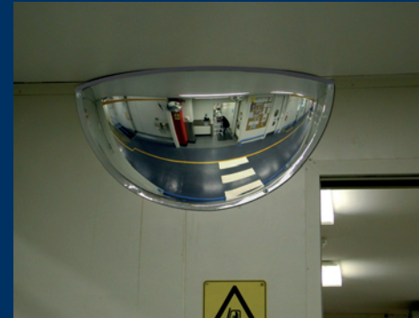
▶ Vandal Prone Areas

(Mounting Screws are not included). All models available in 500mm size only.