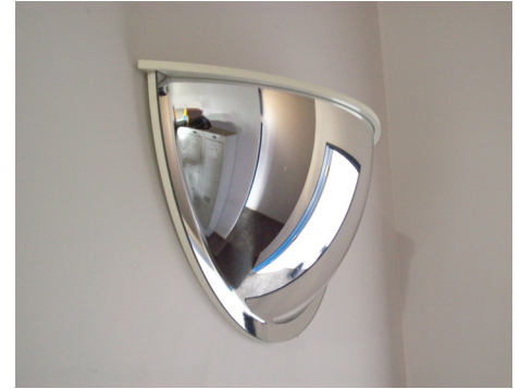
▶ Corridors and Passageways