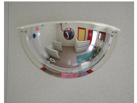
▶ Schools and Childcare