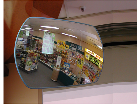
▶ Retail Security