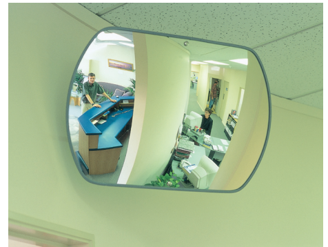
▶ Reception Areas