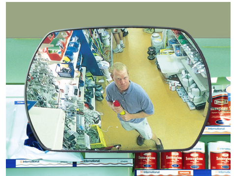
▶ Limited Space