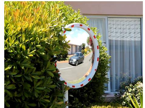
▶ Blind Corners