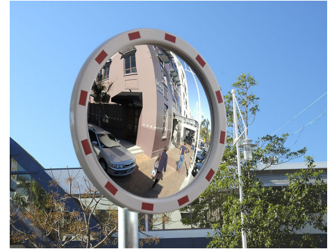
▶ Pedestrian Safety