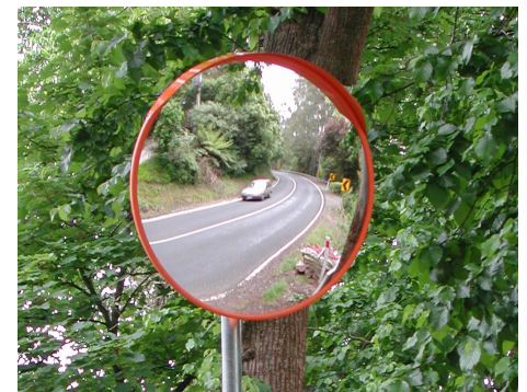
▶ High Speed Traffic