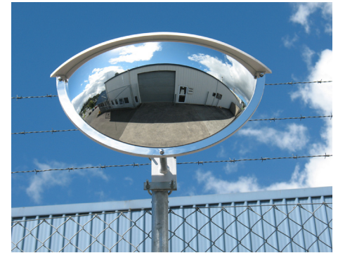
▶ Driveway Two-Way View