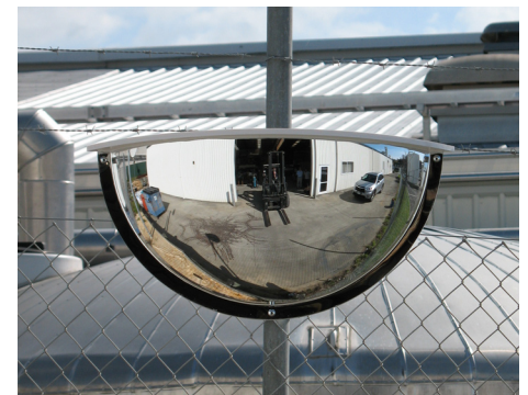
▶ Forklift Safety