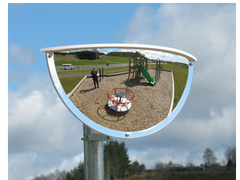
▶ Playground and Childcare Observation