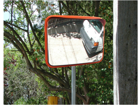
▶ Industrial Safety