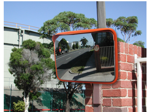
▶ Projectile Prone Areas