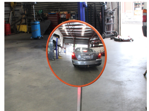
▶ Auto Workshop