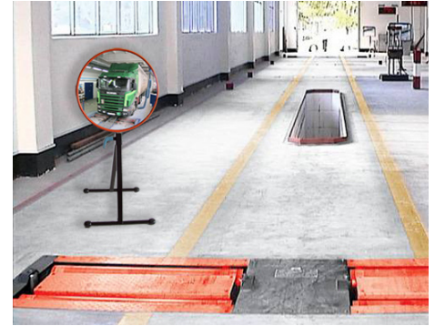
▶ Vehicle Testing Station