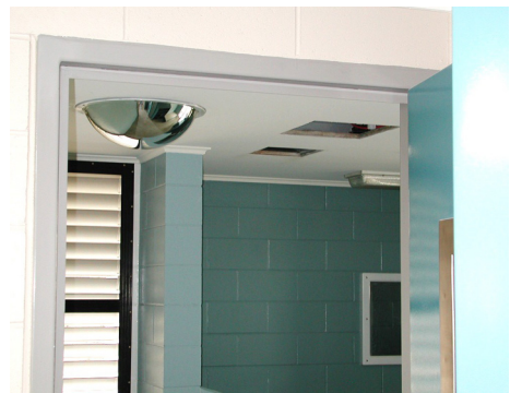
▶ View Safely Before Entering the Cell