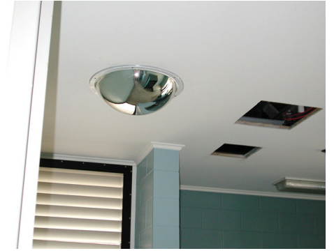
▶ Cell Observation