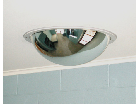
▶ Safely View Hard to See Areas