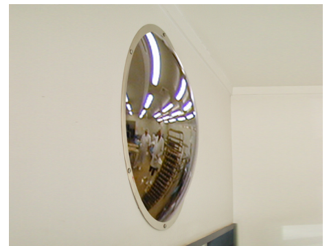
▶ Hygiene Safety Environments