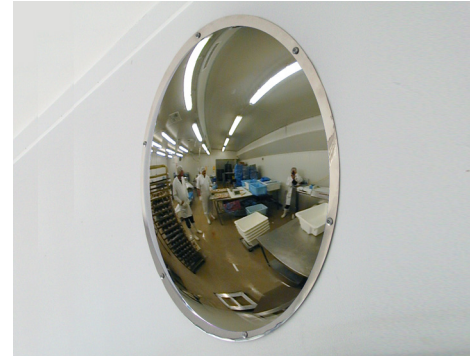
▶ Wide Angle Reflection